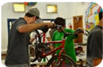
Access to Mobility

The Alstom Foundation is the concrete expression of Alstom's corporate citizenship commitment and a means of contributing sustainably to communities in need .