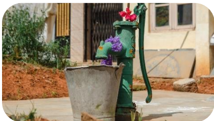
Access to Energy and Water