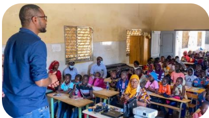
Economic and Social Development